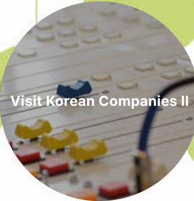
Visit Korean Companies II