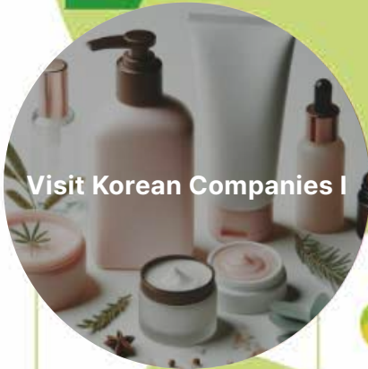
Visit Korean Companies I