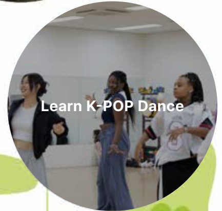
Learn K-POP Dance