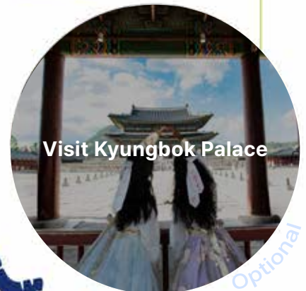
Visit Kyungbok Palace