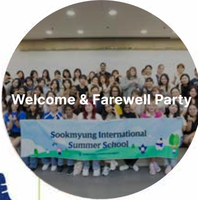
Welcome & Farewell Party